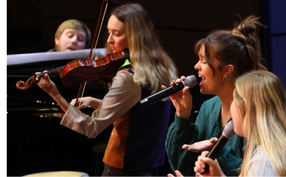
Local teachers led the the inspiring worship time